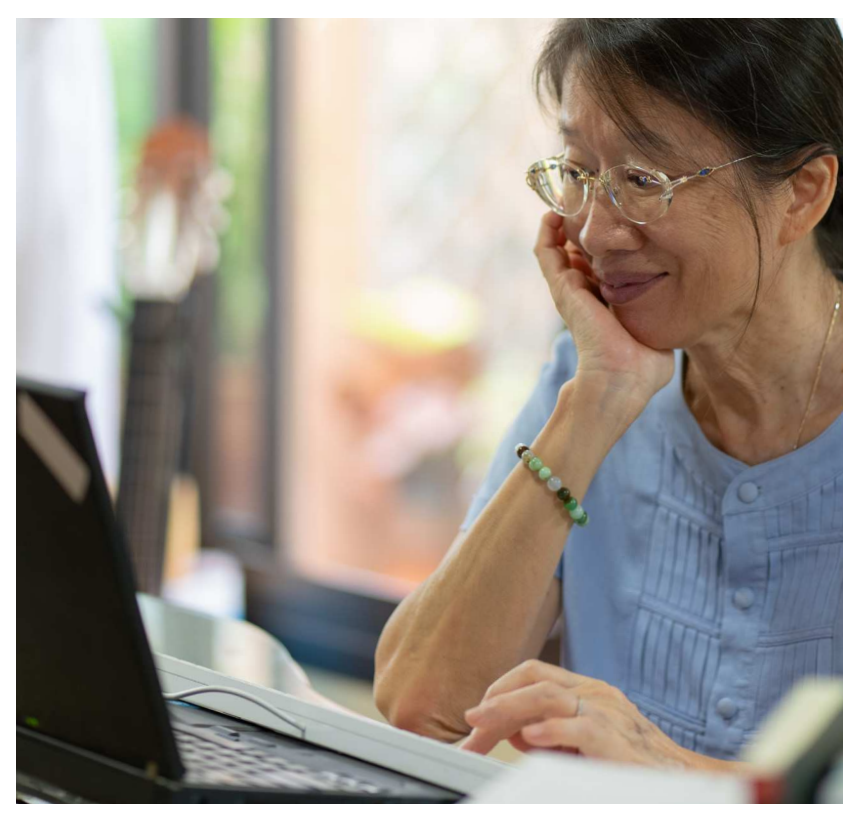
*Registration at Oasis Rochester for this Oasis Everywhere class.