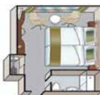
Standard Cabin (162 sf)

Staterooms feature 2 twin beds that can be separated or put together, flat screen TV, hair dryer, private bath with shower, closet, phone, desk, chair & safe. Floor to ceiling sliding glass doors with French Balcony on Mozart & Strauss Decks. Fixed window on Haydn Deck.